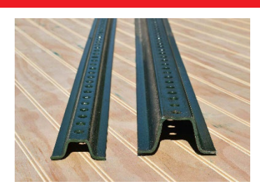
U-Channel Support Post