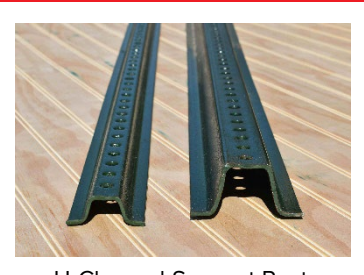
U-Channel Support Post