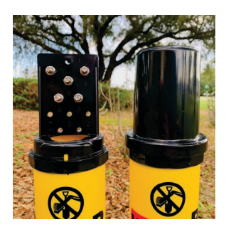
<u>Twist Top</u> Industry standard Twist Top easily attaches to post.