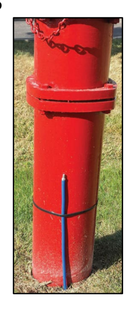
Hydrant Application SNSK-B-01