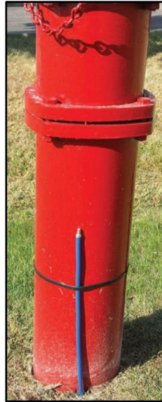
Hydrant Application SNSK-B-01