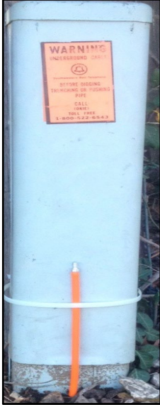
Telecom Application SNSK-N-01